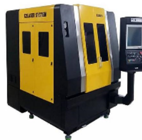
Fiber Laser Cutting Machine